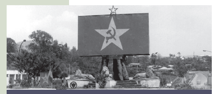
Worker's Party of Ethiopia monument extolling the virtues of communism.