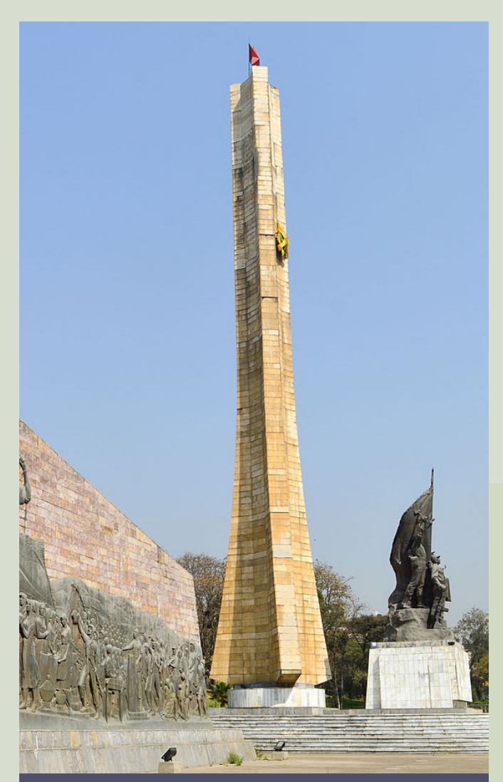
Tiglachin memorial in Addis Ababa, commemorating the Ethiopian and Cuban soldiers involved in the Ogaden War.